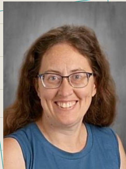
Title I Lead/ML Lead