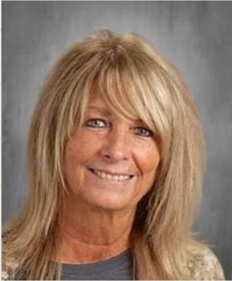
School Office Supervisor